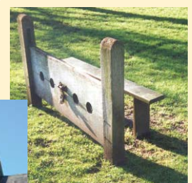
Stocks at Sturminster Marshall

The Northern end of the village with its narrow lanes and mixture of old and new houses, is linked together by a series of greens containing mature oak and chestnut trees. Look out for the war memorial, maypole and village stocks where the walk starts and finishes.