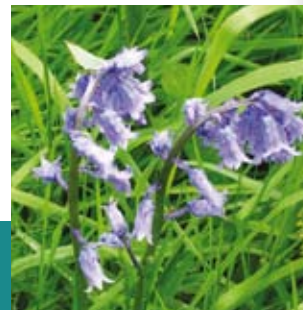
Green hairstreak butterfly on bluebells